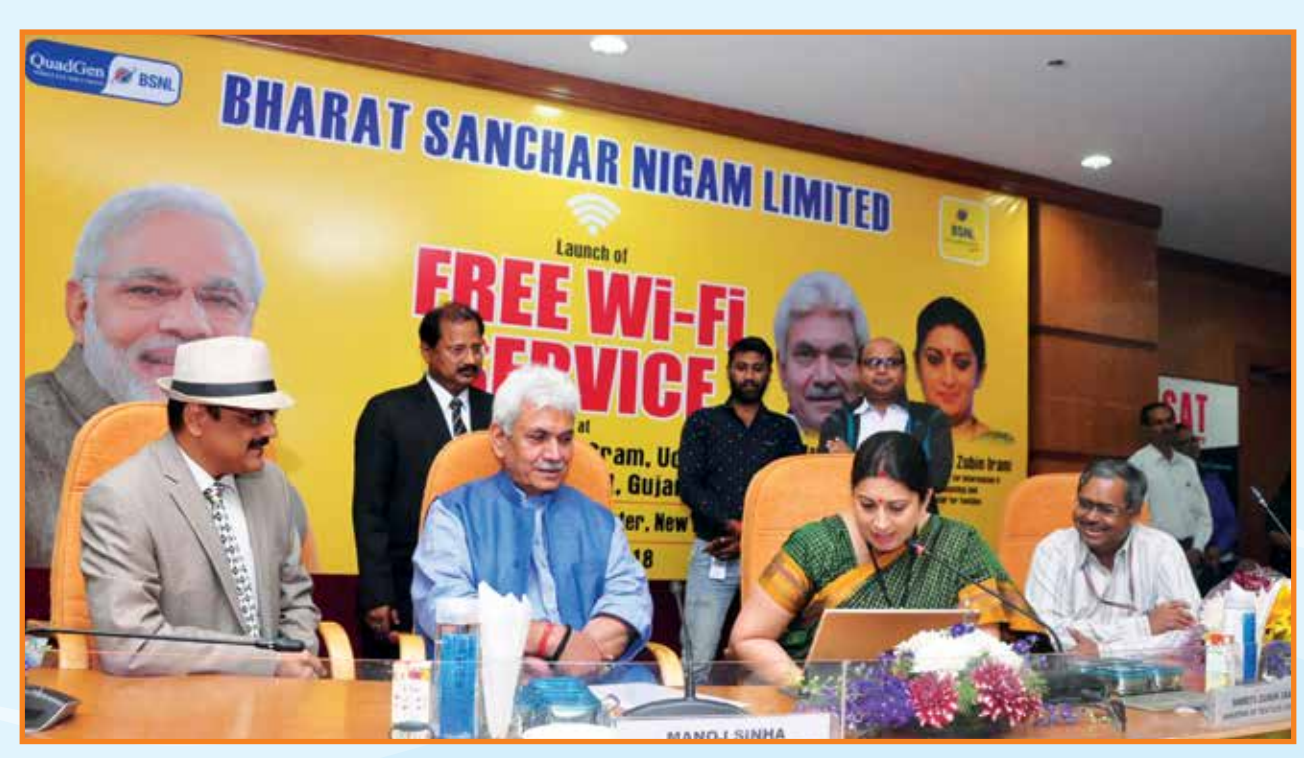
Hon'ble Minister for Textiles Smt. Smiriti Irani inagurating the free wi-fi services from BSNL Corporate Office in the august presence of Shri Manoj Sinha Hon'ble Minister for Communications. Also seen Shri Anupam Shrivastava CMD BSNL and Shri N. Sivasailam Special Secretary (T) in DoT